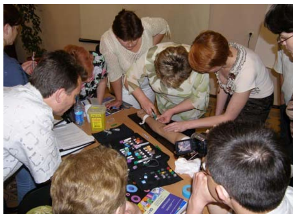
Lectures and interactive classroom work are complemented by hands-on practical sessions at clinical sites.