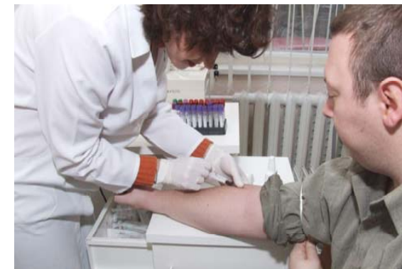
Coursework and onsite mentoring improve both clinical skills and patient care.